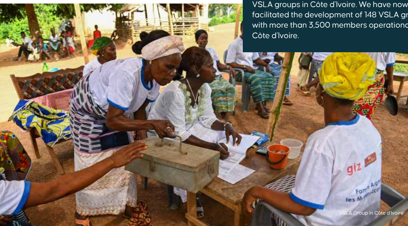
VSLA Group in Côte d'Ivoire

In 2021-22, we helped to establish setup 120 VSLA groups in Côte d'Ivoire. We have now facilitated the development of 148 VSLA groups with more than 3,500 members operational in Côte d'Ivoire.