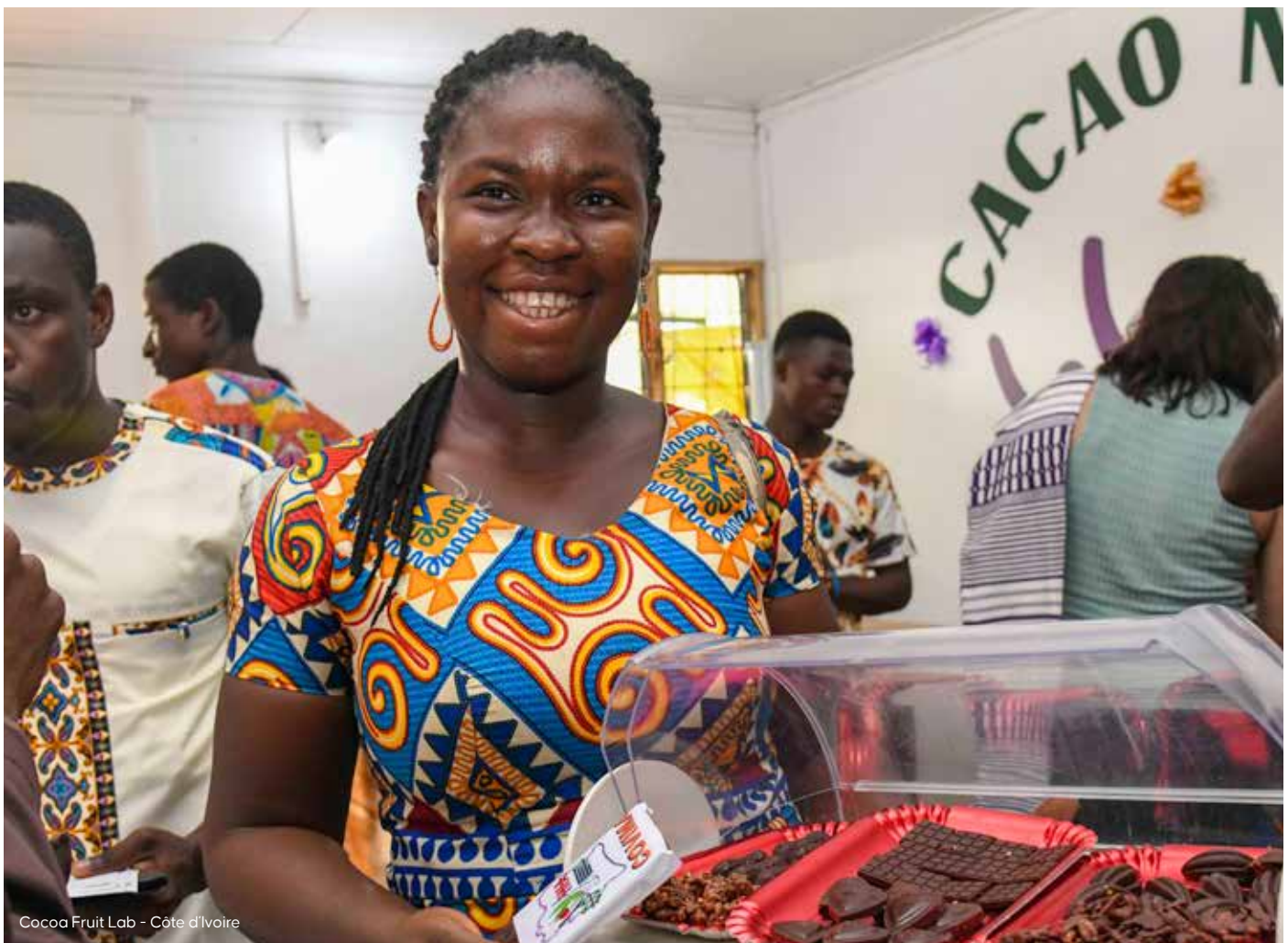
Cocoa Fruit Lab - Côte d'Ivoire

Finally, the project introduces an income-diversification aspect at the farmer level through the collection of cocoa juice. When chocolate is produced, the white pulp that surrounds the cocoa beans is usually lost as a waste product but collecting it and processing it into juice can create an additional income stream with minimal additional cost, raising farmers' incomes by up to 30 per cent per kilo of cocoa beans.