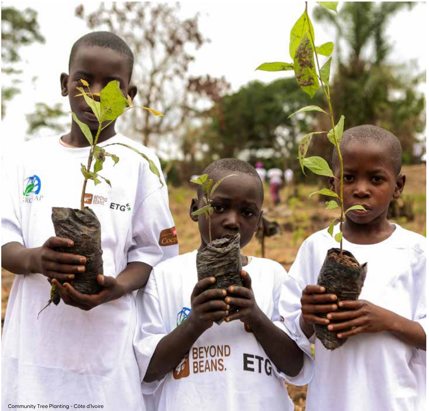
Community Tree Planting - Côte d'Ivoire

hardwood trees can later be used for timber, so long as ongoing reforestation takes place so that forest cover is maintained. Once the trees have been planted, local leaders and Community Resource Management Committees (CRMCs) ensure that the trees are well taken care of by the community. This year, we reforested 97 hectares of land with over 105,000 multi-purpose trees of 8 different endemic species in Côte d'Ivoire on behalf of our clients.