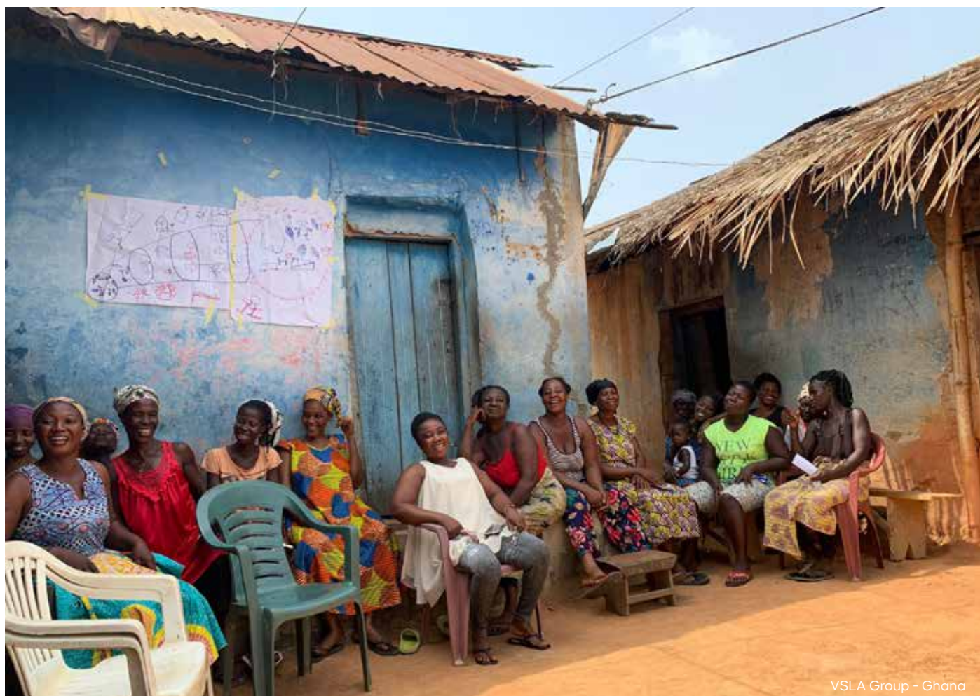
VSLA Group - Ghana

For more information, read our report on the topic .