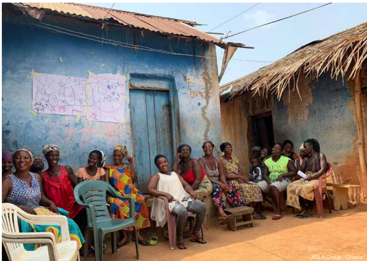
VSLA Group - Ghana

For more information, read our report on the topic .